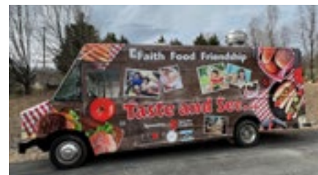
“Taste and See” Food Truck

Each of these youth were encouraged to grow as individuals through WORSHIP, EDUCATION, WORK, and RECREATION. These are our Four Cornerstones of Care for all of our services.