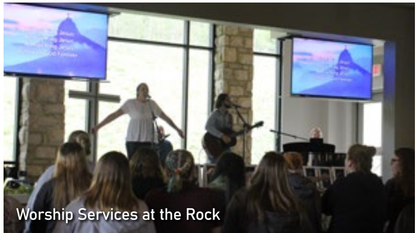
Worship Services at the Rock