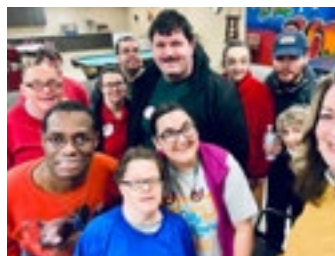
Hope & Thrive Academy